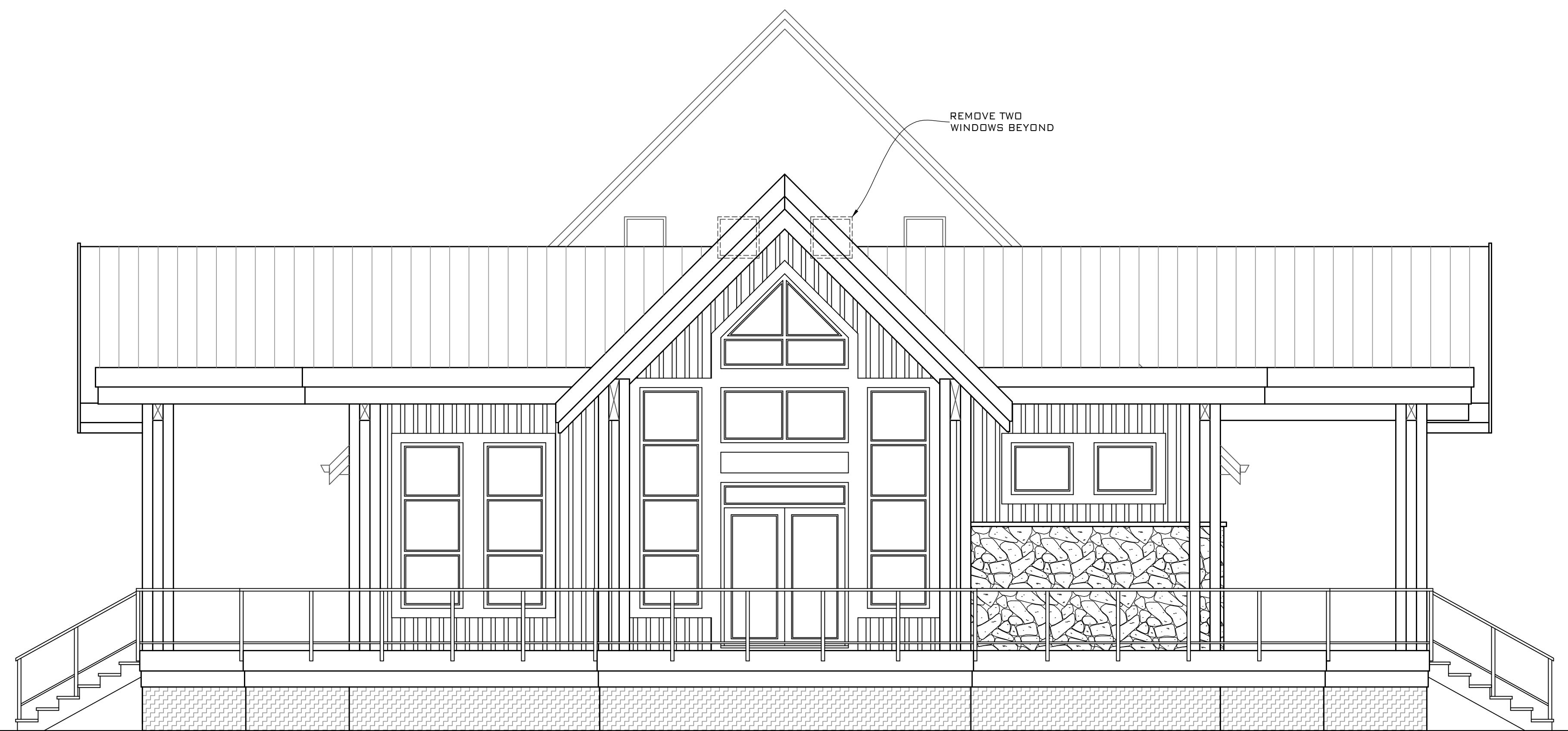
SOUTH ELEVATION SCALE: 1/4" = 1'-0"