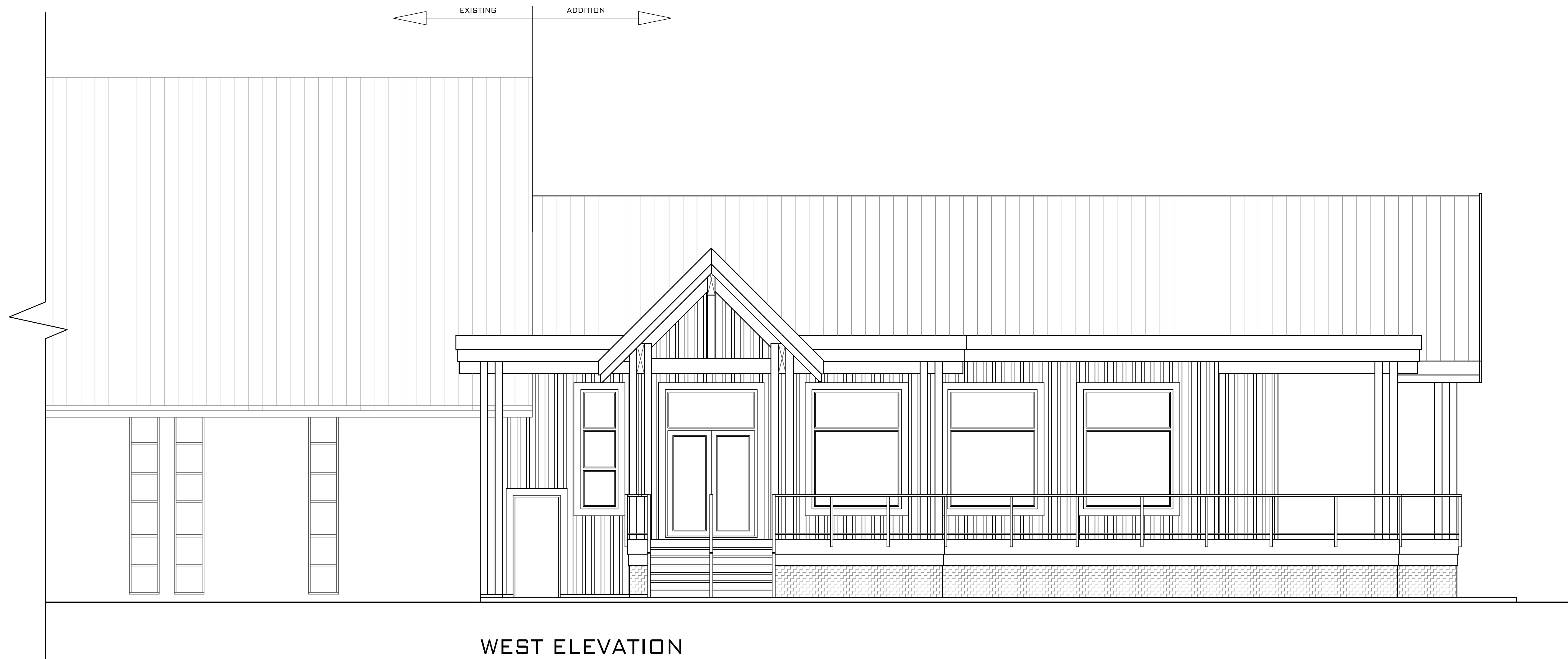
WEST ELEVATION SCALE: 1/4" = 1'-0"